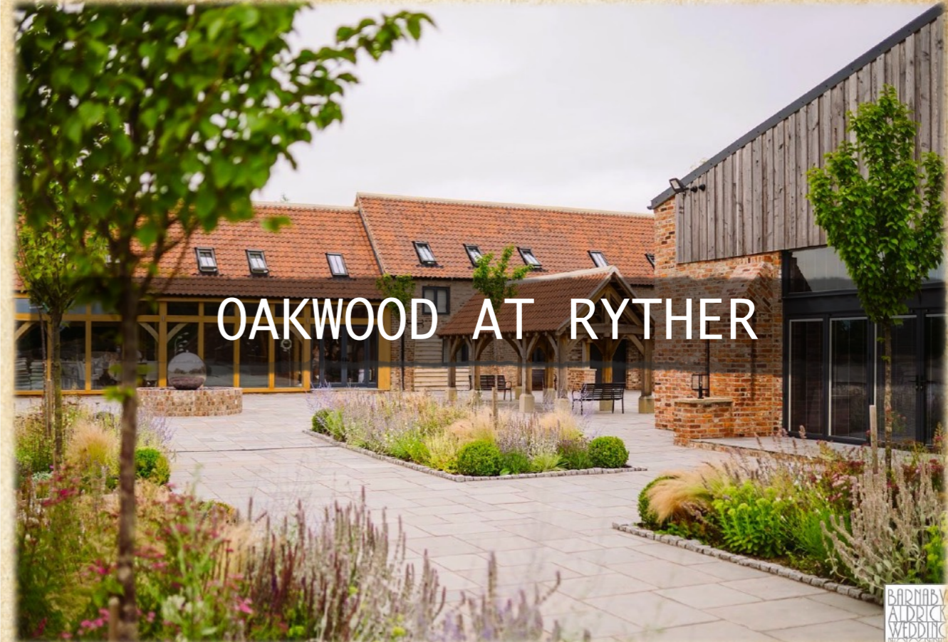
OAKWOOD AT RYTER

The main barn's marquee lining provides a perfect acoustic setting for live sound. There is a great little stage to elevate the performance and has a fabulous dance floor permanently in place. The bar is literally next to both the stage & dance floor which ensures the party stays in one place all night long.